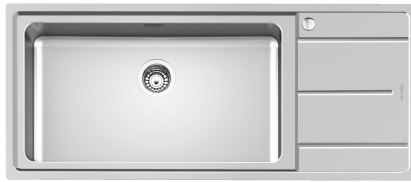
Sink Evo - 3216 05x