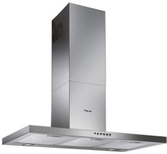
Hood KS 240_002